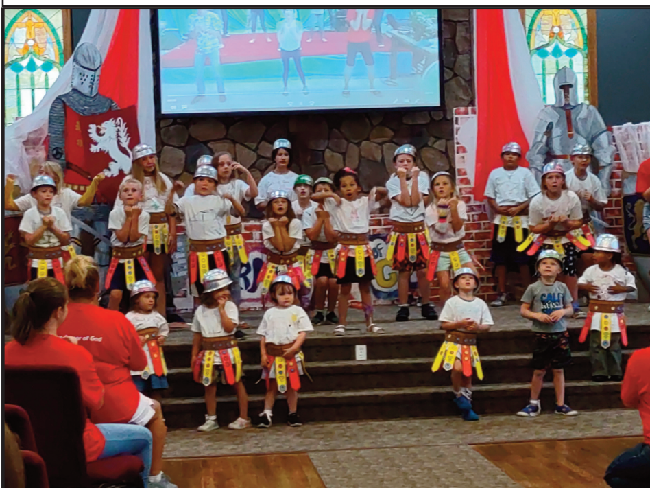
Sylvester Community Church Vacation Bible School kids