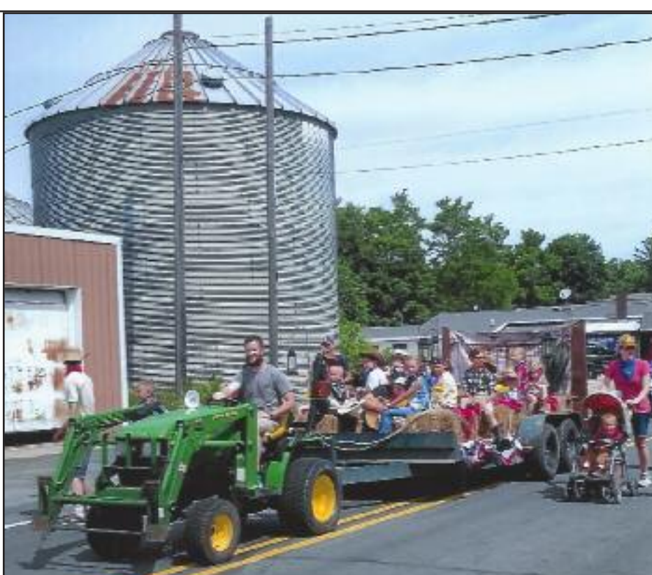
The Coral Day Grand Parade