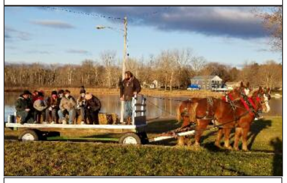
Wagon Rides from last year's Christmas in Lakeview

Ice Sculpting starts at 10 a.m. Watch as they sculp the ice live downtown.