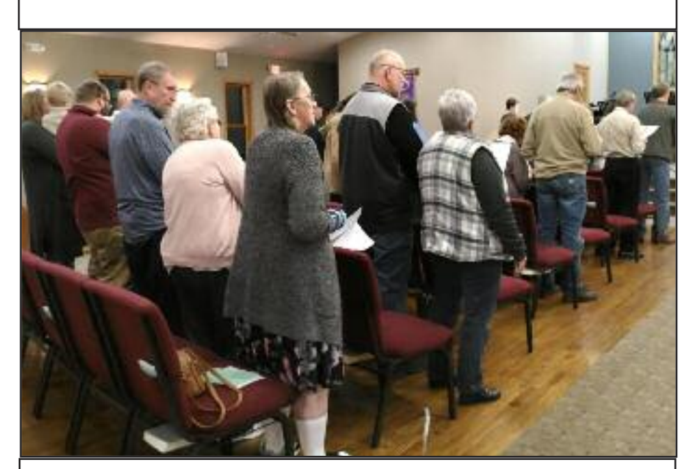
Community members at LAMA's annual Thanksgiving Service