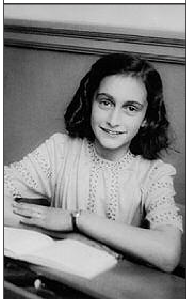
Anne Frank in 1941