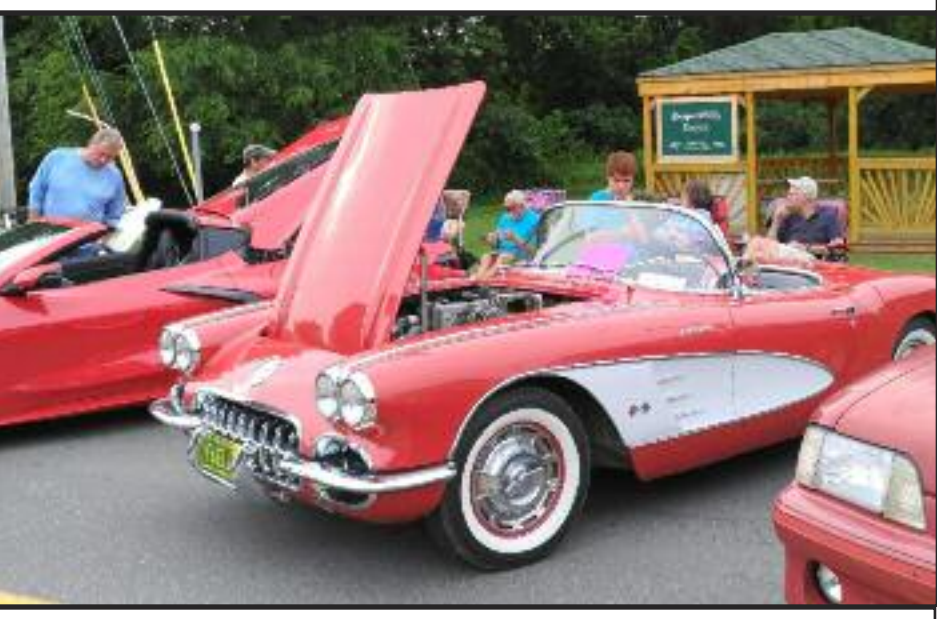
The car show is always a big draw