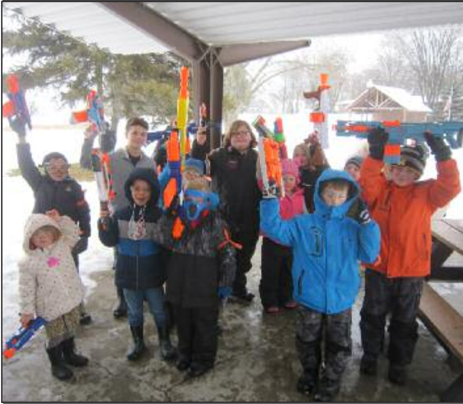
Let the Battle Begin!