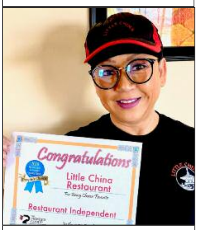
Pai Kue holding Little China's Favorite Independent Restaurant Award