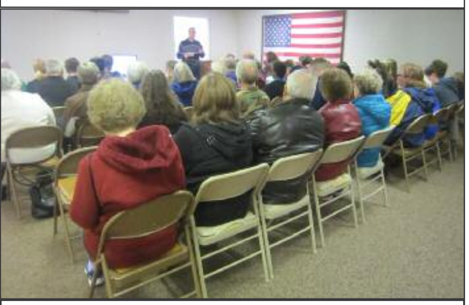
National Day of Prayer service was well attended