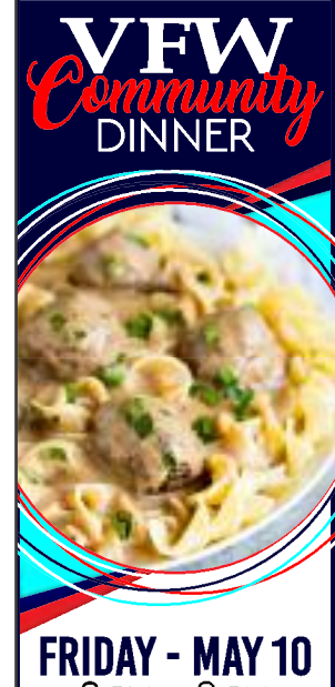
6 PM – 8 PM 8968 N GREENVILLE RD

Graduation season is coming up soon. Next week, we will publish Montcalm Central grads.; the following week we will run Tri-County, Montabella and Lakeview.