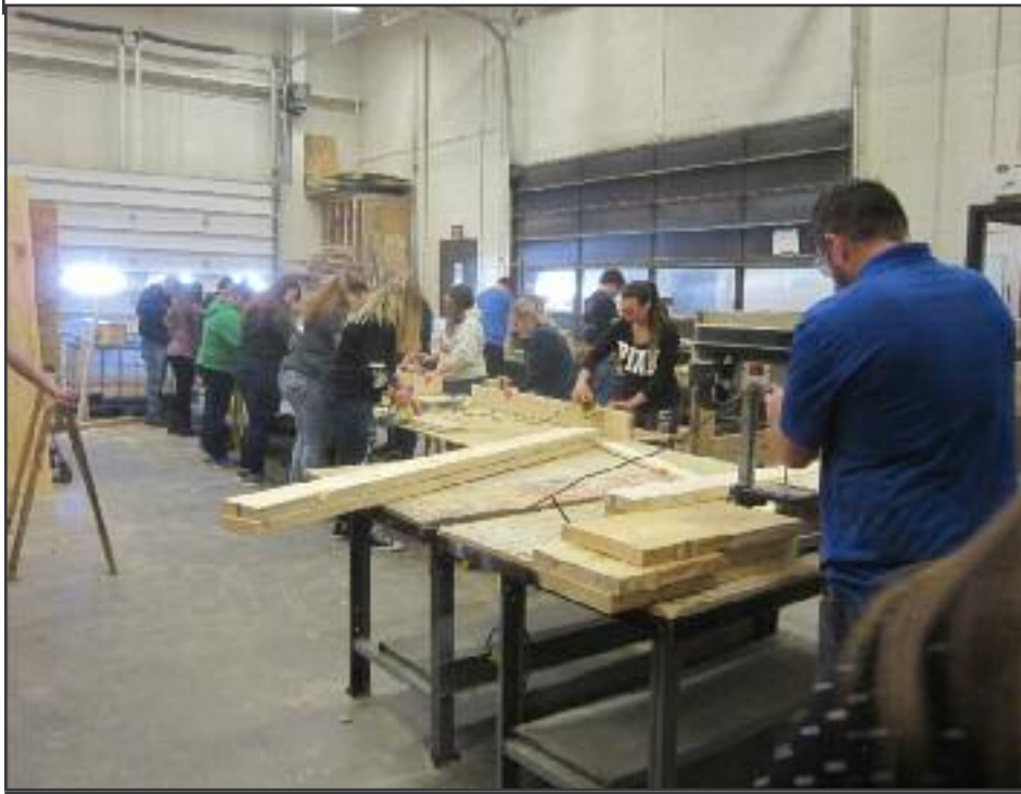
MACC students sanding wood that will go into the bunk beds