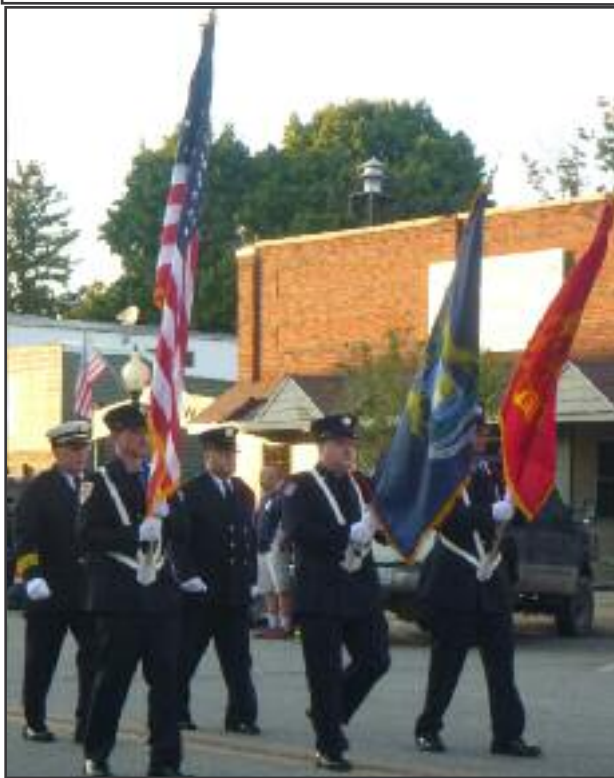
Lakeview's heroes carry the colors