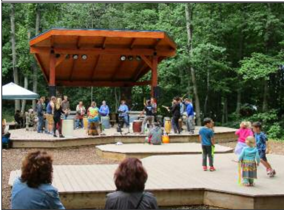
The beat goes on at the Rhythm Stage