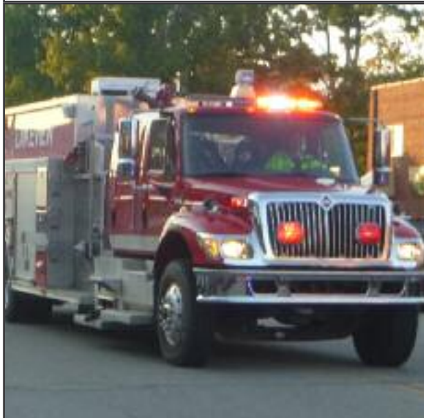
Firefighters pay silent tribute to 9-1-1 heroes