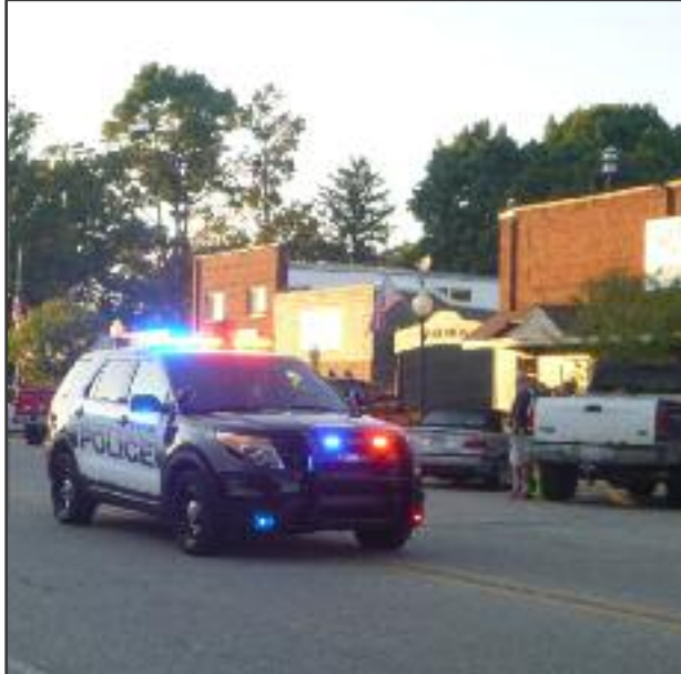
Lakeview Police honor fallen brothers and sisters in blue