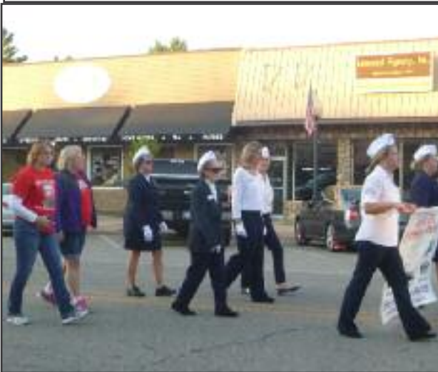
The 4th Annual Silent Parade was organized by the Blue Star Mothers