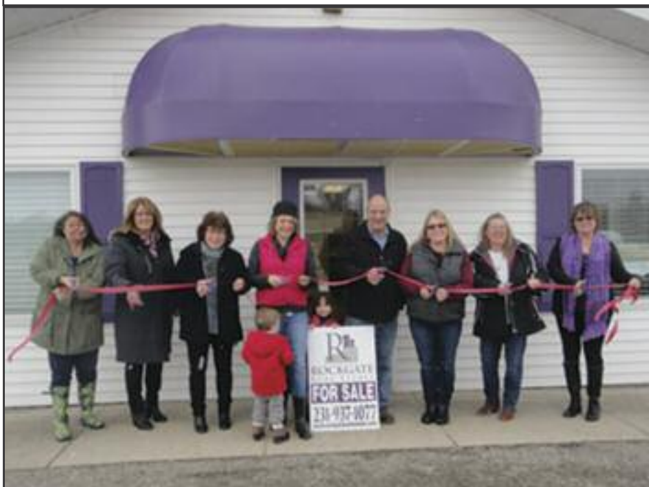
Rockgate Real Estate agents cutting ribbon at their Howard City branch