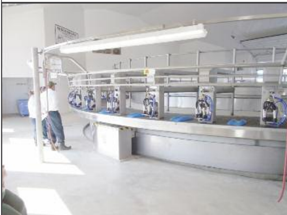
The cows' milking area