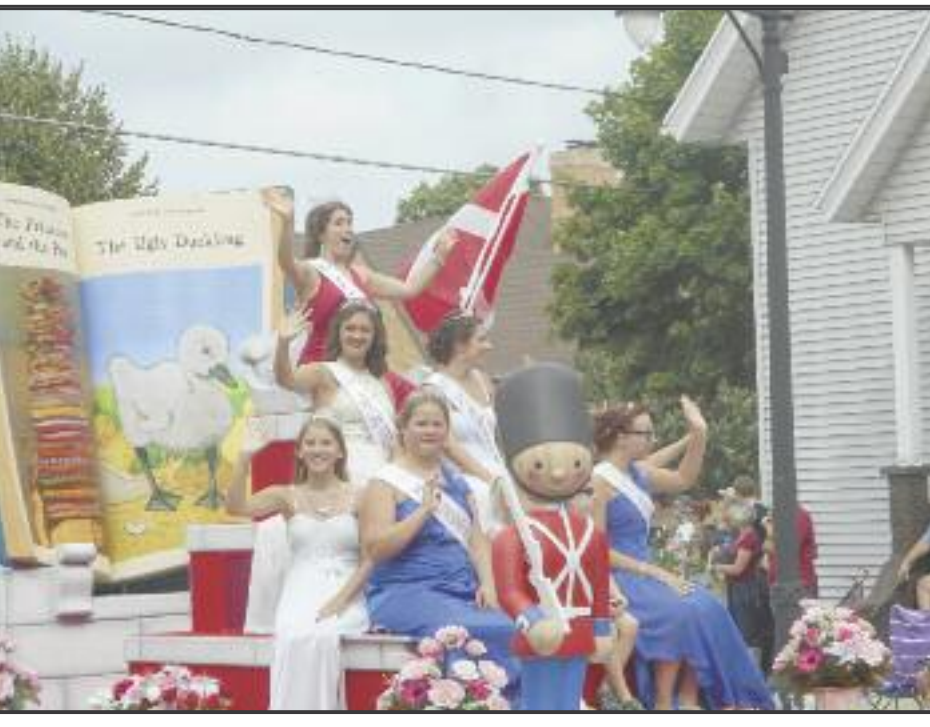
Danish Festival Royalty